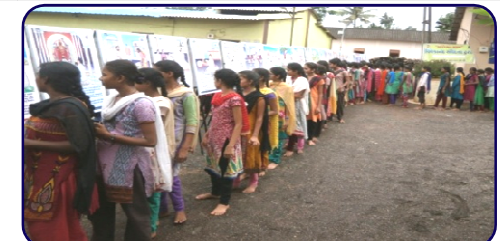
Students are viewing exhibition on Swami Vivekanand in school